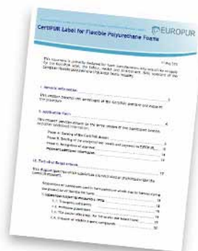
CertiPUR Technical Paper download »