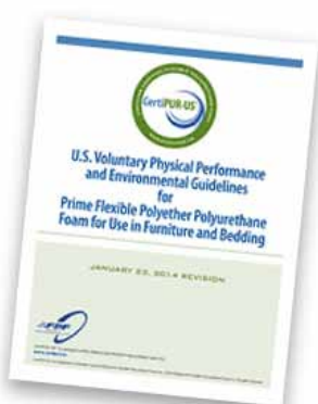
CertiPUR-US Technical Guidelines - download »

We have all of the requisite sampling and analytical equipment for flexible PU foam (FPF) analysis and characterisation for a variety of industries including the producers of foam stock, re-formed and molded foam and end user clients who use the foams in furniture, bedding and clothing products.